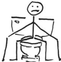
CPY Man taking care of business

What if the CPY man put down the CPY sign and did stuff...?