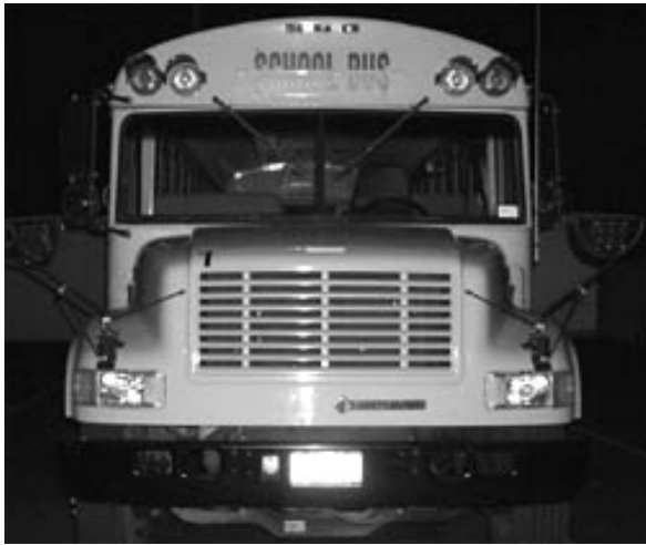
Famous CPY Bus