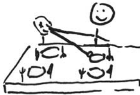
Eating with friends