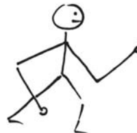
Walking down the street