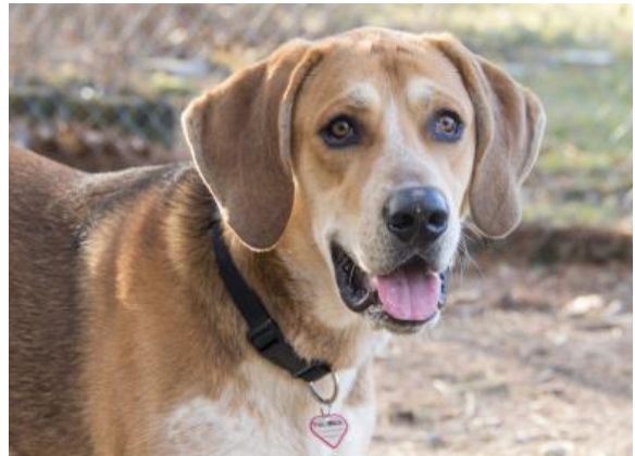
Toby in the Spring of 2020

Bangor Humane Society remains committed to keeping an animal for as long as it takes. Thank you for making a donation that will ensure we have the resources to care for all the Toby's who may still be waiting.