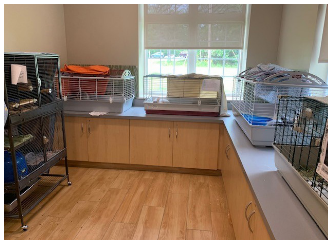
Small animal nook for rabbits and other critters

Our old configuration did not accommodate the care and keeping of small animals such as rabbits, chinchillas, and guinea pigs. As the popularity of these critters has risen, we've needed more space to house our littlest furry friends. The new Animal Care Nook addresses this necessity in a wonderful way. With plenty of natural light, the "Nook" is located much farther away from the public entrance and from all the noises that can make our critters very nervous! We now have room for 4-5 small habitats and floor space for a standing habitat.