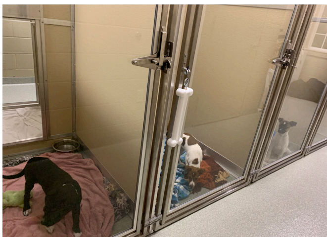
Insider view of our puppy transport room

Here's a peek into our new puppy transport receiving room! The Plexiglass doors keep vulnerable puppies safe from communicable diseases and go a long way in making our pups more comfortable. Our animal care coordinator can easily observe our new visitors. Of special note, at one time, this room housed an incinerator that had not been used for many years and is certainly no longer necessary at BHS. This space is now filled with hope and the prospect of wonderful new memories.