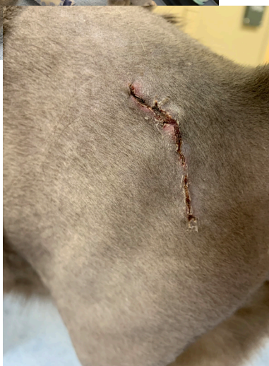
A close-up of Caribou’s scar

Caribou joined Bangor Humane Society as a stray in April of this year. Despite his very serious appearance, we soon learned that Caribou was a smart, gregarious boy that easily charmed anyone who met him.