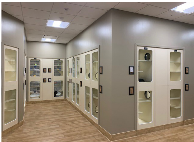
View of cat condos upon entering BHS

One of the biggest changes in our facility has been our cattery! Not only did we add 20 kennels behind the scenes for cat care and surgical recovery, but we made major upgrades to the shelters for cats who are officially ready for adoption! They now have more room to move around and climb, along with a private cubby for their litterboxes. Our ventilation and filtration systems were improved so that our cats are breathing cleaner air, reducing the transmission rate for upper respiratory infections by over 90% from last year! Added bonus: potential adopters aren't met with the scent of kitty litter.