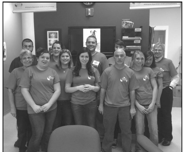
The BHS ASPCA Mega Match-a-thon team!