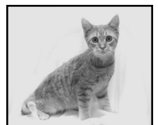
Josh thanks you for your support!