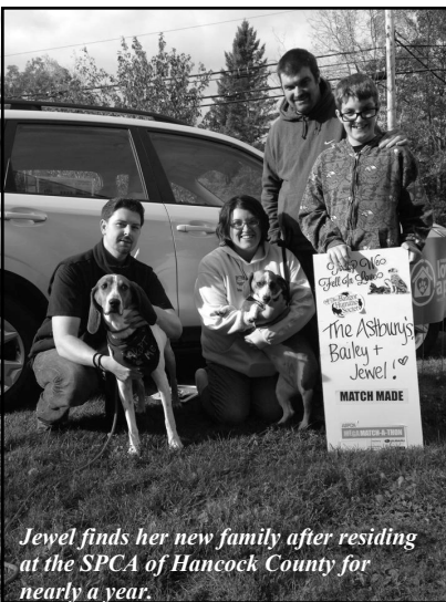
Jewel finds her new family after residing at the SPCA of Hancock County for nearly a year.

The ASPCA awarded the Bangor Humane Society a $5,000 grant to support the event. The funding allowed us to market the event extensively and provided every adoptable pet with a microchip, collar and ID tag, a medical exam, spay/neuter surgery, and vaccinations. While maintaining all adoption poli-