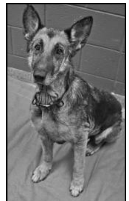
"Spirit" before treatment.

"I'm not sure who needed who more," he said, "but there is no doubt in my mind that we needed one another. And with the help, patience and generosity of the Bangor Humane Society, we are more complete and certainly happier because we are together."