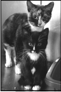
A mom and her baby await at BHS for an available foster home.