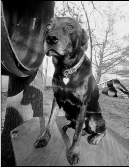
Thunder, playing in the BHS play yard while he awaited adoption.

The 139 days of Thunder started in early November 2012 when a family surrendered their 5 year-old Rottweiler/Labrador because he wasn't a good match in their home with their small children. When Thunder first arrived, he had double cherry eye (a defect in the eye that causes a protrusion of the eyelid in the form of a red, fleshy mass) and he also