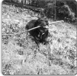
Thunder enjoys his new life of swimming, sticks, and tail wags!