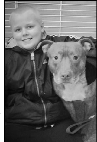
Shorty, a BHS long-term resident Pitbull, gets adopted by his now best friend—an eight-year-old boy.

The folks at Green Acres Kennel Shop will gladly sit down, for free, with anyone considering bringing a new pet into the family to discuss what kind of pet, breed, and age, would work best with your family. ■