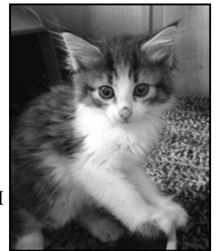
A kitten, recently returned from foster care, awaiting adoption at BHS.

Day 14: I don't know how long I've been here now, but my babies sure are getting big. That person that keeps coming in our room is really nice and fun. She plays with us a lot. Some of her friends come in with her and play with us too. I hear them call her "the crazy cat lady." I wonder what that means? I'm not sure. But, I know that this lady was telling the truth that day in the car. We have everything we need