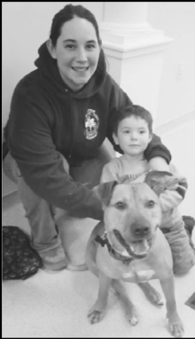
Puddles, a BHS long-term resident, finds her forever home with a big family.

Children are most at risk of being bitten. They are small, move fast, and are most apt to hug and kiss dogs that may not be agreeable to it. That is why children, more than any other population, are often bit in the face.