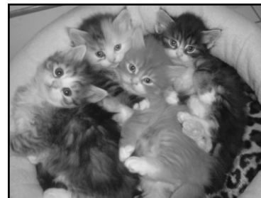
A litter of foster kittens happily resting in foster care.